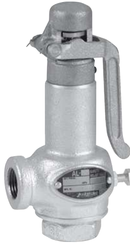
Open type with a lever