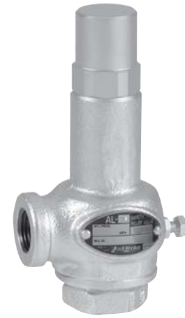
Open type without a lever